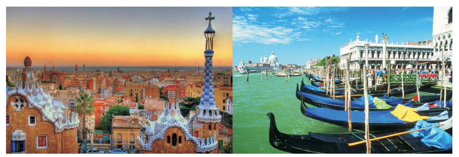
September 18 - October 5, 2011