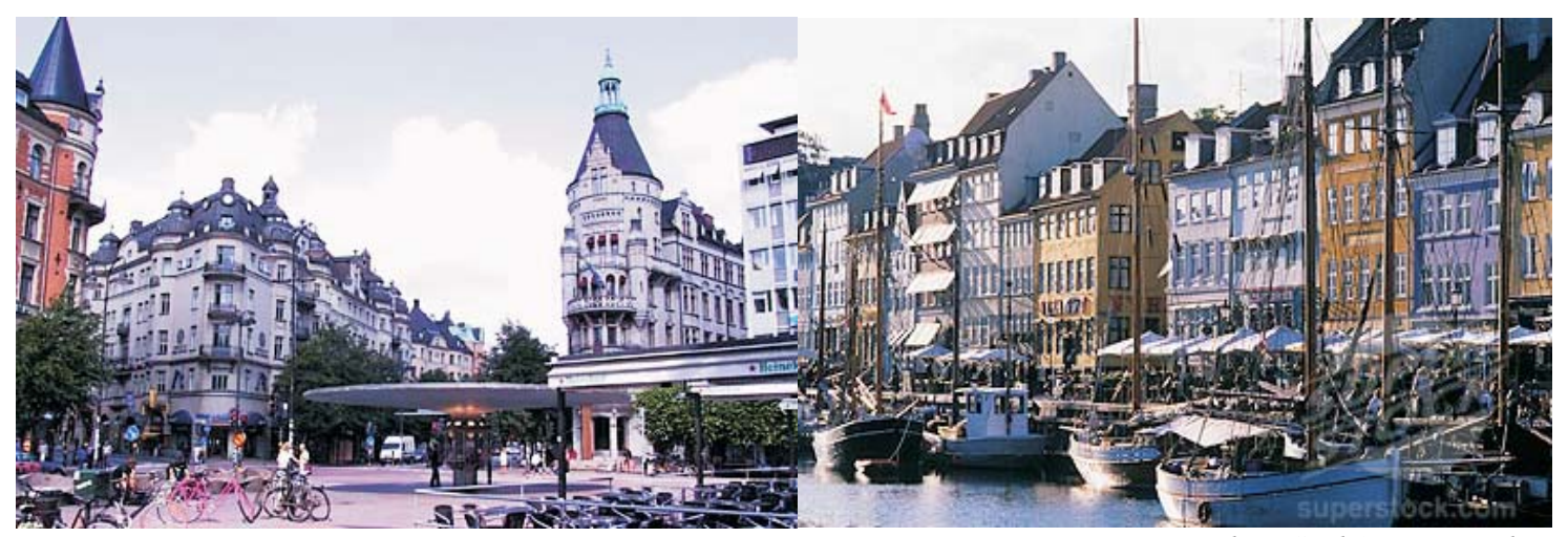
August 9 - 24, 2011